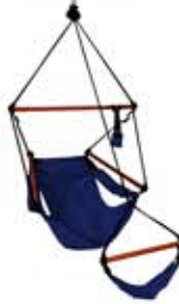
Original Hammaka chair